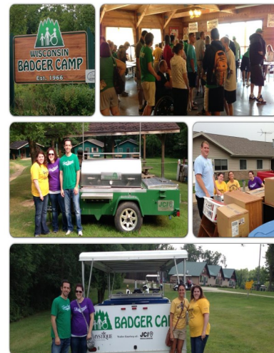
Jaycee members from across the state visited Badger Camp, on Saturday, August 10.