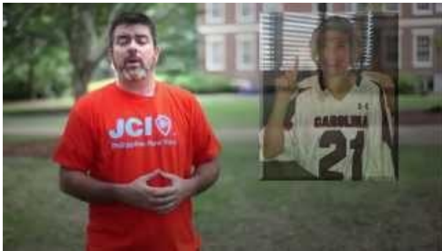
JCTV Episode 16