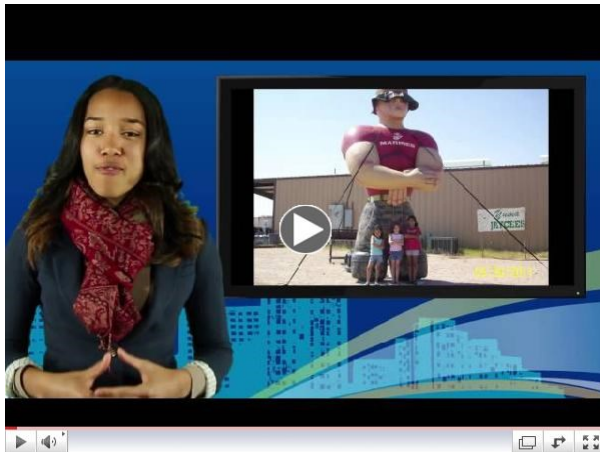
JCTV Episode 8

This year's Indoor Olympics was hosted by the Manitowoc Chapter.