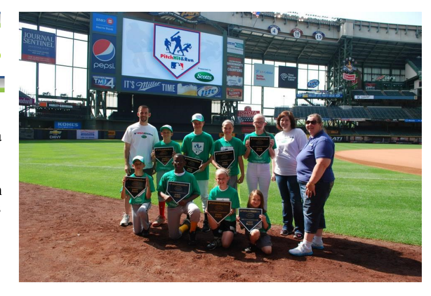
2013 Pitch Hit & Run State Champions at Miler Park

The shirts have been ordered. Recently, members voted on the front logo and back quote for the *Brand New* La Crosse Jaycee shirt. Members signed up for their shirt size at the family picnic and extras have been ordered to accommodate members who were unable to attend. Each shirt costs $5 to purchase for members and the Chapter is covering the remaining cost. The shirts will be available for pick-up at RiverJacks on Tuesday, July 2 or at Riverfest to be worn at all future Chapter projects to promote and show support for the Chapter. Remaining shirts will be on first come, first serve basis and will be available at the hall.