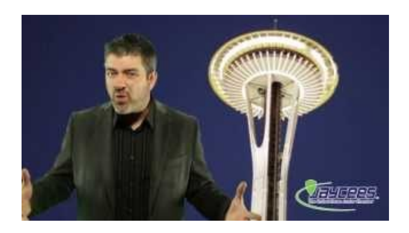
JCTV Episode 12